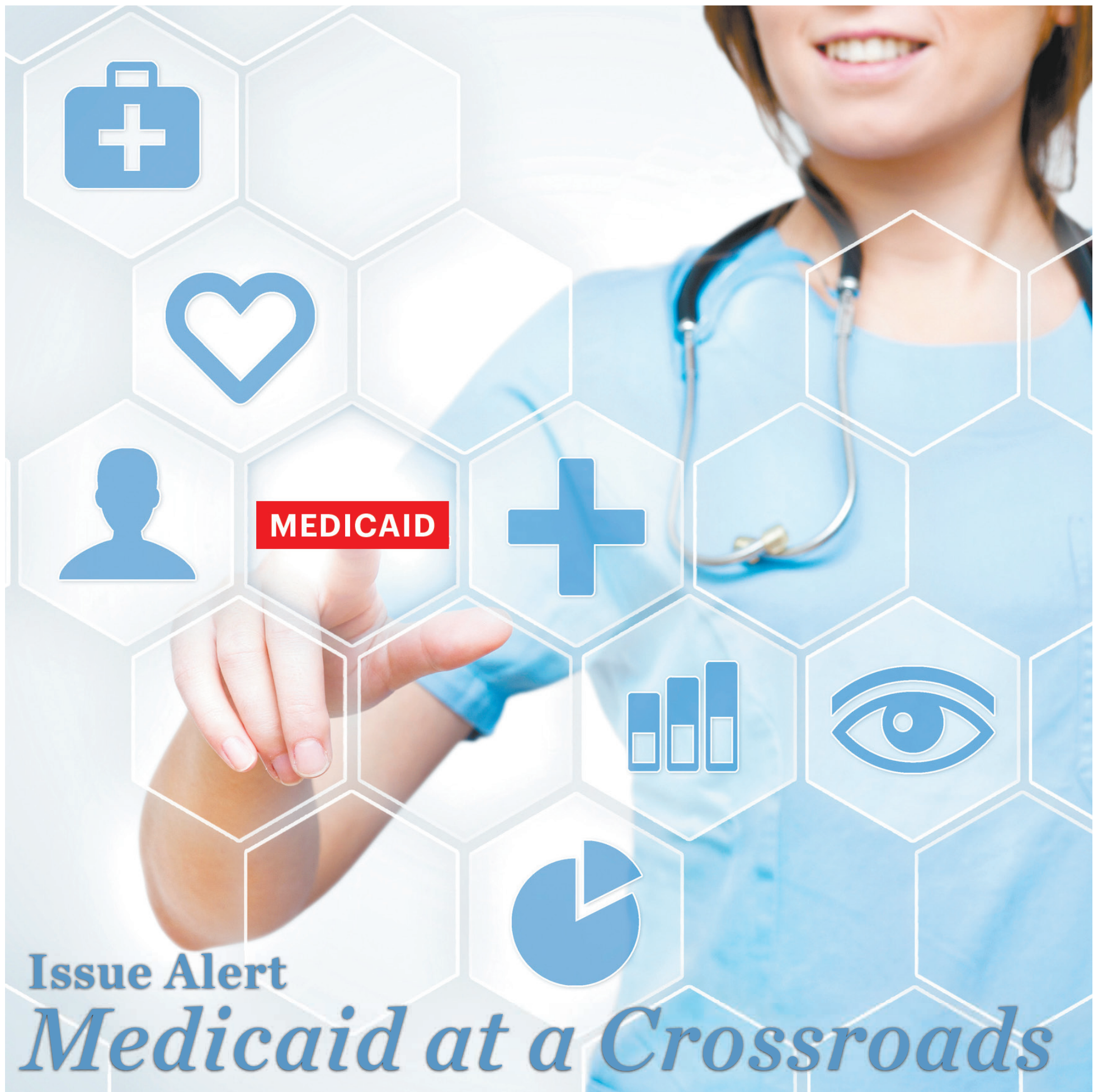
TABLE of EXPERTS Series